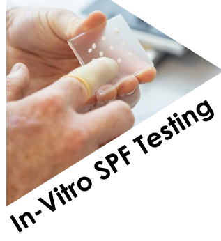
In-Vitro SPF Testing